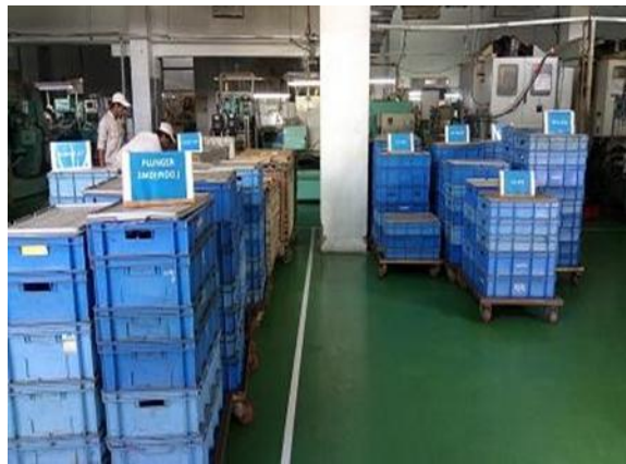
FIGURE 3. Conditions after implementing 5S