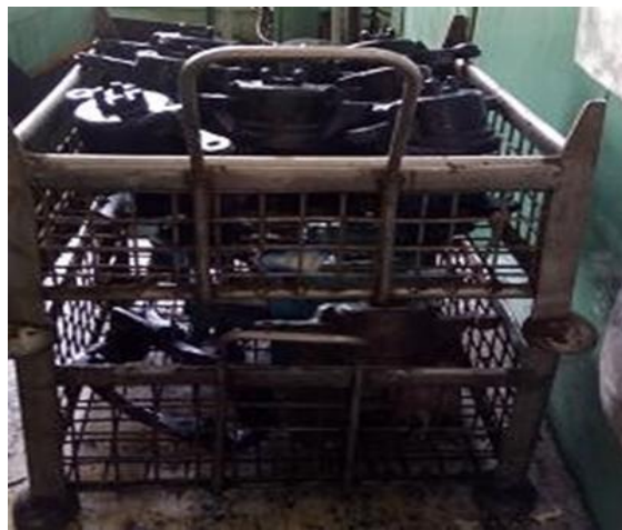
FIGURE 5. Dummy parts in organized manner