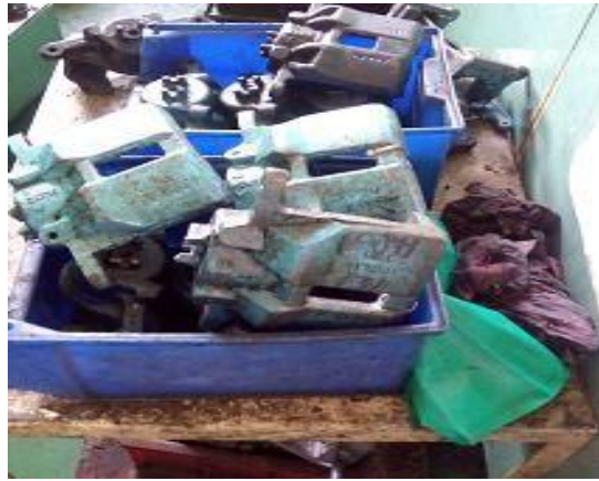
FIGURE 4. Dummy parts in unorganized manner

at the provided place after use. So, to avoid the misplace or damage of the parts as shown in figure 5.