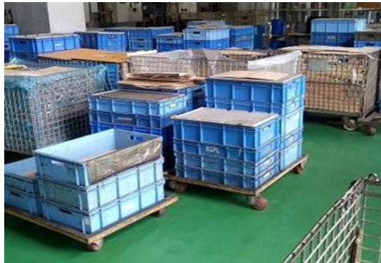
FIGURE 2. Conditions before implementing 5S

optimum utilization can be done of the stock and no parts are lost or damaged as shown in figure 3.