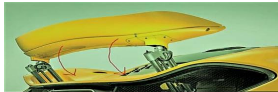
FIGURE 3. Rear Spoiler