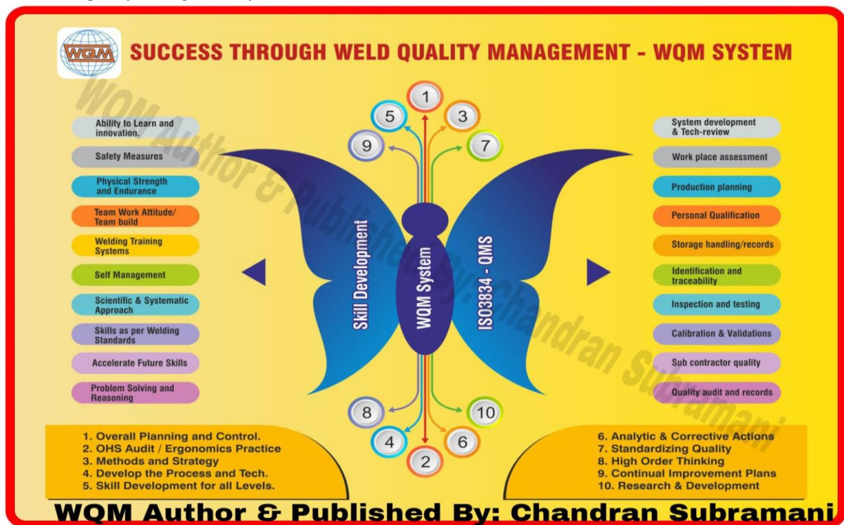
FIGURE 1. Methodology using new system in weld quality management (WQM)

Ref: UIJIR ISSN (O) 2582-6417- Vol. 3 Issue 9, Feb 2023 / DOI No. – 08.2020-25662434.