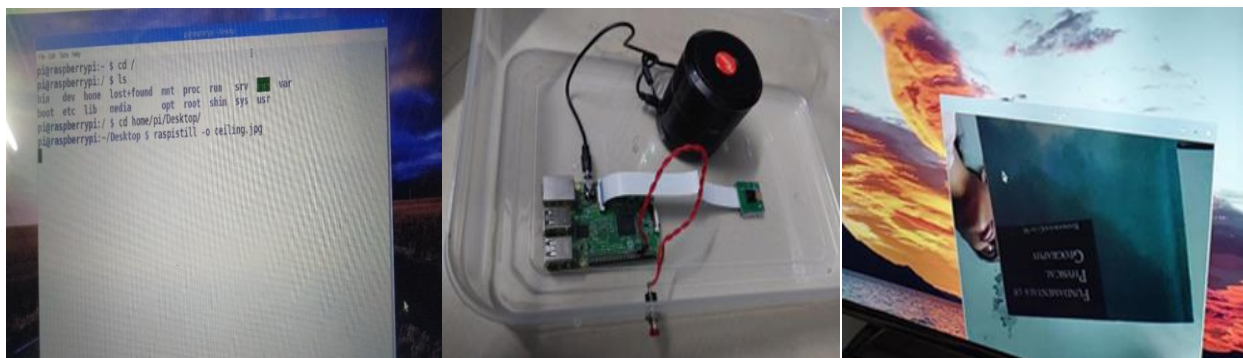
FIGURE 2. Enabling the pi camera