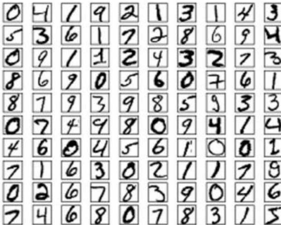
Image Recognition with Neural Networks Already we introduced the concept of perceptions, which take inputs from simple linear equations and output 1 (true) or 0 (false). They are the left-hand side of the neural network.