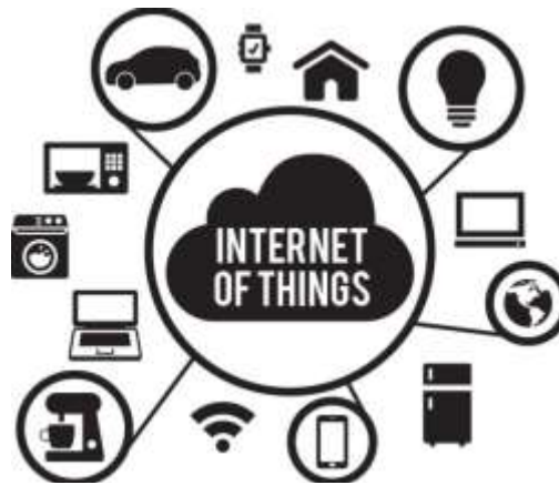
FIGURE 2. Internet of Things (IOT)