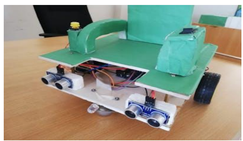
FIGURE 1. Electric wheel chair